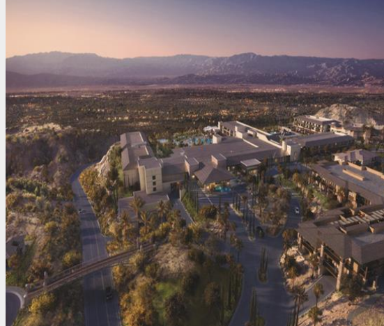
The Ritz Carlton Rancho Mirage Palm Springs, CA April 3-5, 2016 Rate $335