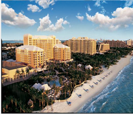
The Ritz Carlton Key Biscayne-Miami Key Biscayne, FL April 12-14, 2015 Rate $349