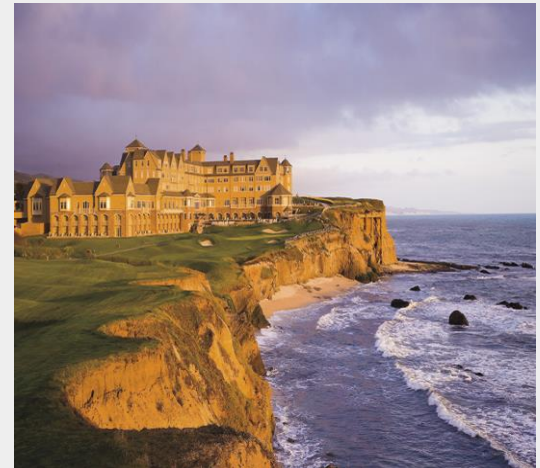
The Ritz Carlton Half Moon Bay Half Moon Bay, CA April 23-25, 2017 Rate $300